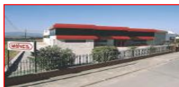
Mainca World Headquarters Barcelona, SPAIN

Mainca USA Inc. reserves the right to alter any specification without prior notice.