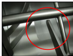
Grinder Opening Seals to Prevent Ingredients and Water from Falling into the Auger