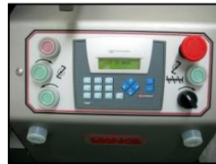
Programmable Mixing Timer & Display