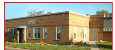
Mainca USA Headquarters St. Louis, MO USA

Available Exclusively Through Authorized Mainca USA Distributors